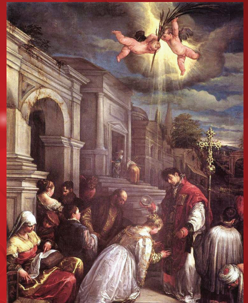
By Jacopo Bassano (Jacopo da Ponte)

Today, Valentine's Day is a celebration of love, but generally without the entanglements of persecution and martyrdom thrown in. •