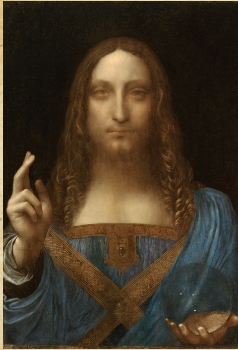
By Leonardo da Vinci - Getty Images, Public Domain, https://commons.wikimedia.org/w/index.php?curid=64103353